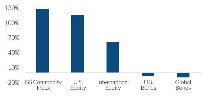
Chart 1: Returns Since the Pandemic 3/31/20-3/31/24

Performance is gross of fees. Please see important disclosures at the end of this whitepaper.